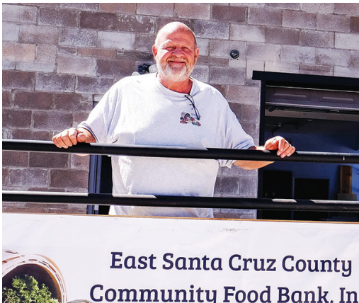
East Santa Cruz County Community Food Bank. Inc.

The PRT - Your Local Resource for Information